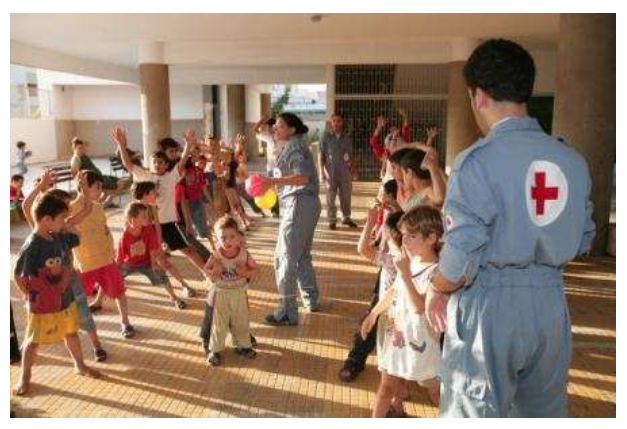
Volunteers from the Lebanese Red Cross plays with children in Madame Aoun School in Mount Lebanon, which was turned into a temporary shelter for displaced people during the conflict.

field. After the training, ten of the trainees started debriefing the LRC volunteers. Debriefing of volunteers is now taking place all over Lebanon.