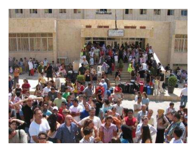
At the university in Aleppo.

an evacuation operation of Swedish citizens who were caught in the conflict in Lebanon.