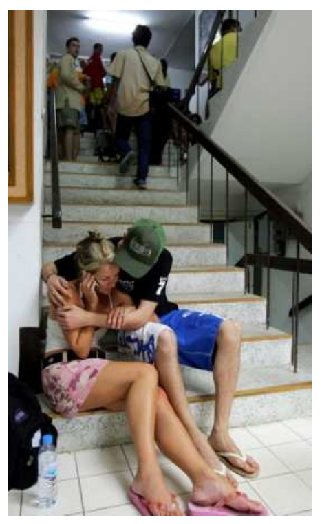
A British tourist talks on the phone as she waits at Phuket city hall, after surviving the tsunami.

There was also an increasing reality that body recovery and identification was going to be a long drawn out process, which may take many months. Many also face difficult decisions ahead. Those who have lost several family members now realise that whilst their bodies may be found and identified, there may be months between each recovery. Survivors are beginning to wonder how to respond. Should they have a funeral as each person is recovered? Or should they