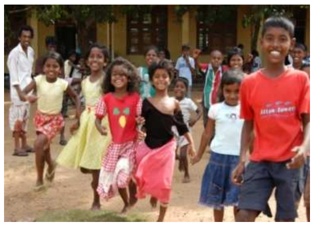
Children are a particularly vulnerable group. Facilitating playful activities can help bring back a sense of normality in their lives

Red Cross staff and volunteers have been working tirelessly. They have been involved in recovering the dead, providing first aid and collecting data on dead, missing and displaced people. They all seem very supportive of each other and volunteers meet daily with a supervisor to discuss the problems they encountered. Still, they are exposed to unusual demands and very stressful situations. Information on signs of stress and guidelines of coping with stress, stress