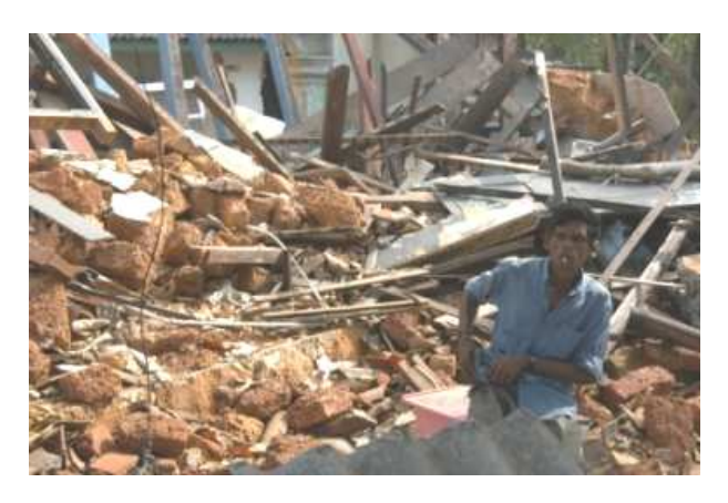
How to start rebuilding when so much has been lost?

The massive tidal waves that swept into coastal villages and seaside resorts in Sri Lanka killed thousands of people in Sri Lanka; houses were destroyed, and many people were left homeless and live in temporary shelters. All along the south and east coast people have started to return to where their houses once stood. Most houses have been reduced to rubble. Some people have begun clearing the area, some look for possessions; others just sit and stare. How to start rebuilding when so much has been lost?