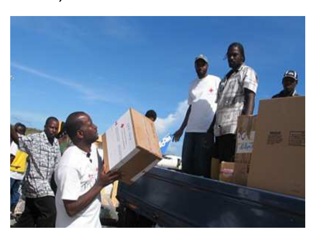
Many volunteers feel that helping others and participating in the relief work is meaningful and helps them to avoid feeling overwhelmed and victimized by the disaster.

"When I sit under the tarpaulins at home I get worried about the future, and I argue with my mother".