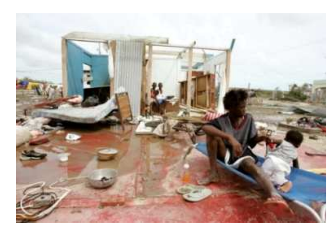
A Jamaican family outside the remains of their home after the hurricane.

The needs of special populations such as the elderly and the mentally ill were not adequately addressed in the shelter situation