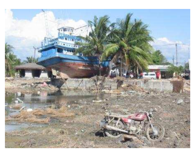
Ban Nam Khem village, North of Kao Lac.

Many of the survivors were initially in a state of shock for the first week to ten days following exposure to the trauma. In time, this eased and as the numbing effect of this initial period diminished, they began to process the whole experience. Symptoms such as intrusive images, nightmares, low mood, irritability, poor sleep and appetite, were reported by many.