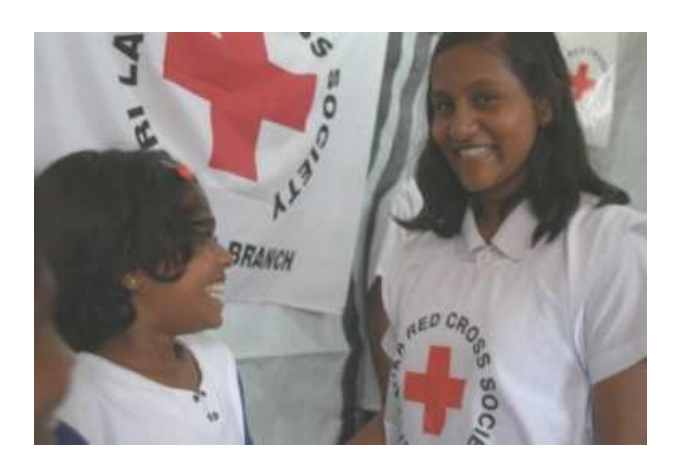
Staff and volunteers worked tirelessly helping the victims after the tsunami. It is important that they get support as well.

The need to involve a psychosocial support component in the emergency response after a disaster like the Tsunami seems to be apparent, also to those who were not convinced right after the disaster struck. Psychosocial support can play a role in bridging the gap between the emergency and rehabilitation phase. It is important to stress that a psychosocial support component should be included in emergency preparedness programmes. Awareness-raising among policy makers might be a challenge in the years to come.