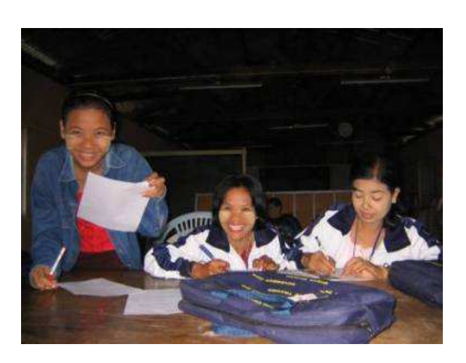
When the participants have finished the training, they are expected to pass on their knowledge to fellow volunteers in their home branches.

One of the core activities of the IFRC Reference Centre for Psychosocial Support is assisting national societies to set up psychosocial training programs for volunteers or staff. The objectives of the training can vary depending on the expectations and capacity of the national society and the manner in which psychosocial support is already integrated in existing programmes such as first